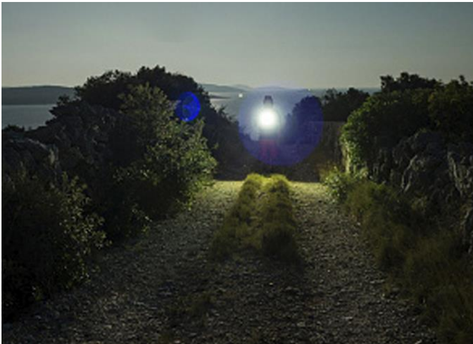
The high-power LED is particularly well suited for use in flashlights and work lights and can extend the day.