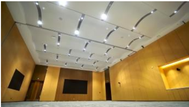
Lighting Solutions by Osram in the media center of Shenzhen World.