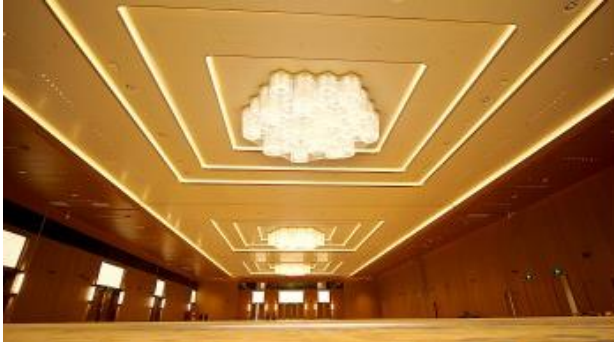
Lighting Solutions by Osram in the banquet hall of Shenzhen World.