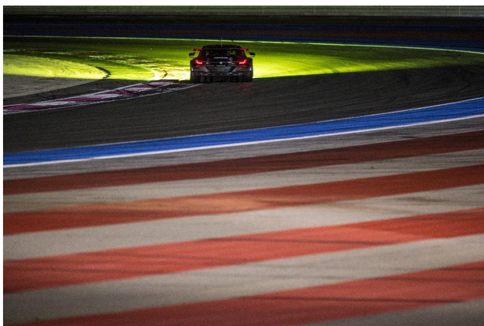
LED light provides best view during the night.