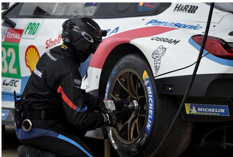
The racing team will be supported with biologically effective lighting from Osram.