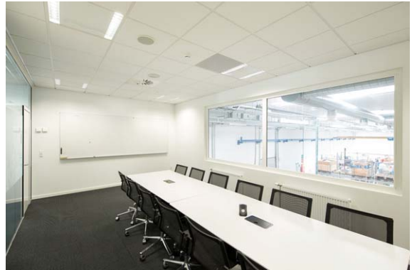
Downlights and louvre luminaires in the offices and conference rooms provide pleasant, VDU-compliant lighting.