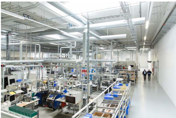
The Modario trunking system for the flexible, homogeneous illumination of production areas.